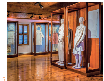
4. Municipal Historical Museum, Former Brika Mansion. 5. "Chrysallida" collection of the museum. 6. Tzivre industrial complex